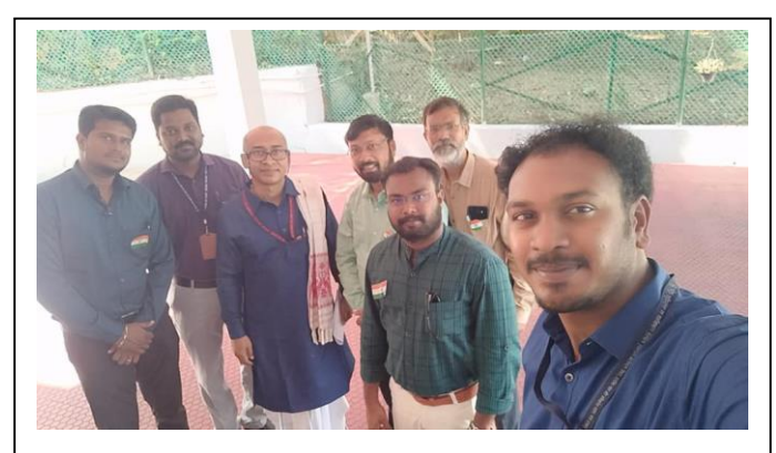
Official duty at Andaman from 24<sup>th</sup> to 28<sup>th</sup> January 2020