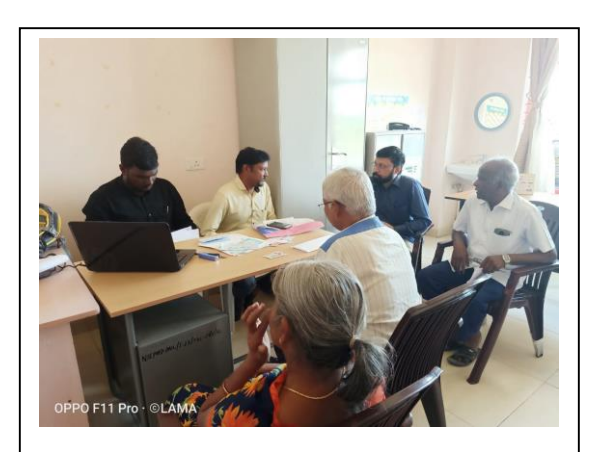
Organised a camp on Legal guardianship at NIEPMD in collaboration with Swastik Trust on 9<sup>th</sup> January 2020